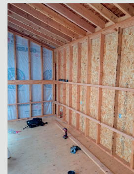
Prepping for shelves

compromised by the original layout of the lines and to get the proper fall and flow in the lines for the system to function optimally, we need to relocate the bathroom entirely to the other side of the space. We have a plan to move forward and in working with the proper departments have attained required permitting. Now to continue with the work to make the space ready to occupy once more bringing the Women and Children's shelter back to full capacity. Right now, we are utilizing the 2 upper level areas of the shelter to provide limited availability for beds.