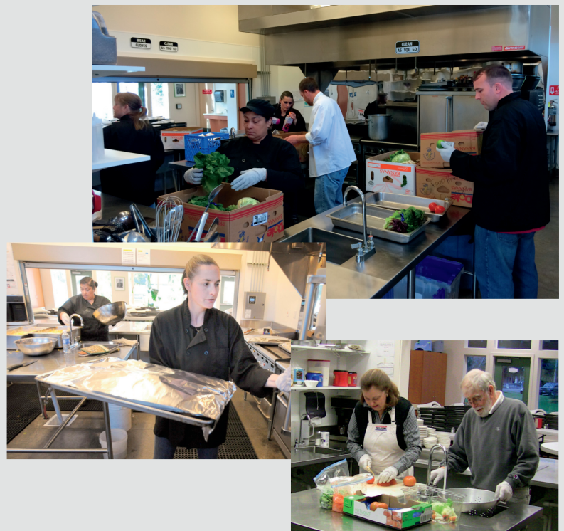
Volunteers and Hunger to Hope Students prepare meals at Cafe