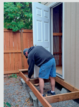
Building the deck