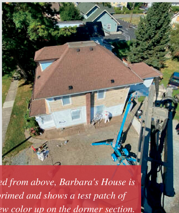
Viewed from above, Barbara's House is half primed and shows a test patch of the new color up on the dormer section.