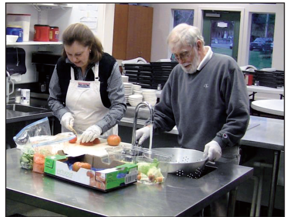
Volunteers from First Evangelical Lutheran Church joyfully prepare a meal for the homeless community.